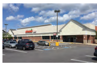
Main Street Marketplace Nashua, NH