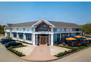
Wayland Town Center Wayland, MA