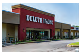
Shops at Mall Road Burlington, MA